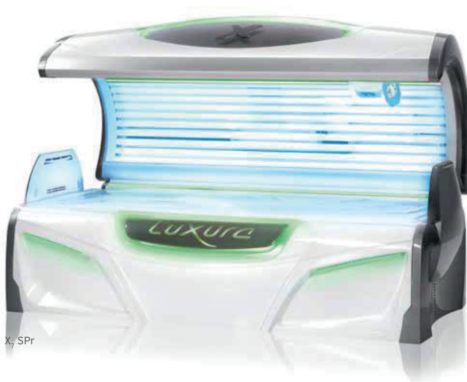
X 7 SPi