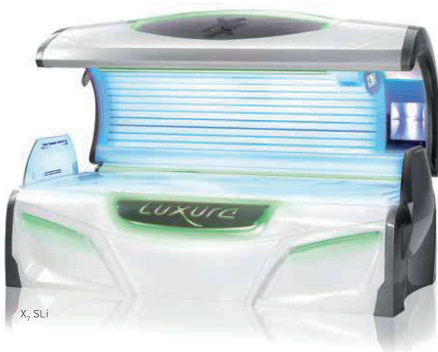
X 7 SLi